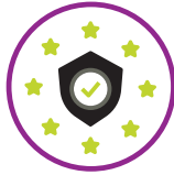
Safety and Best Practices