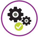
Fundamentals of a Device