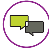
Customer Service Skills