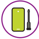
Proper Usage of Tools